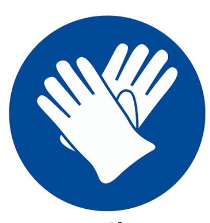
Wear Gloves Protect your hands.