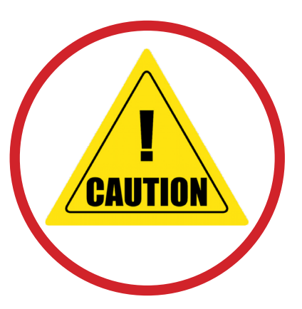
Road Caution Always face traffic.