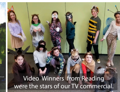
Video Winners from Reading were the stars of our TV commercial.