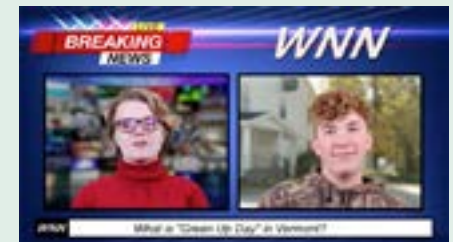
2021 Winners - Websterville Christian Academy

The winners will receive prizes based on group or individual submissions.