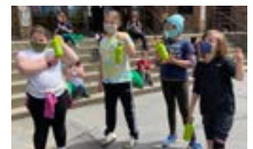
2021 Winners - 4th Graders at Champlain Valley Elementary

The winners will receive prizes based on group or individual submissions.